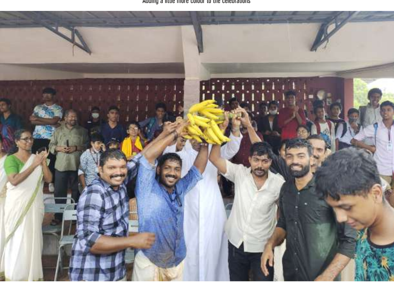
The drizzle didn't fizzle out their zeal; they battled it out and lifted the organic cup in the Onam edition of staff vs students cricket match.