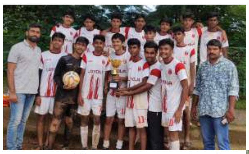
Runners-up in CISCE A Zone Football Tournament (Under 19)