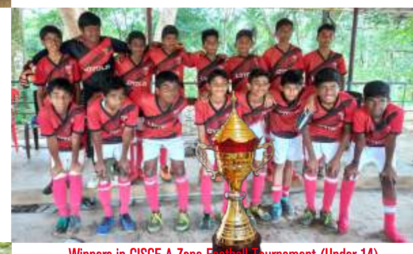
Winners in CISCE A Zone Football Tournament (Under 14)