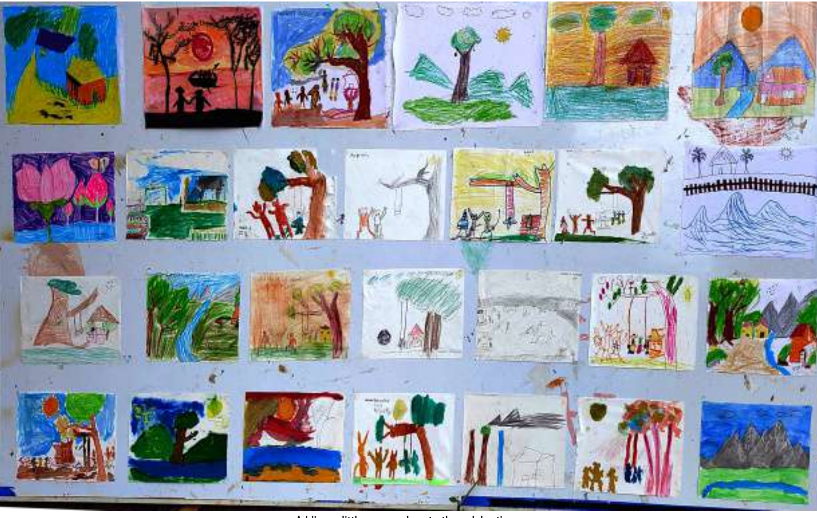
Adding a little more colour to the celebrations